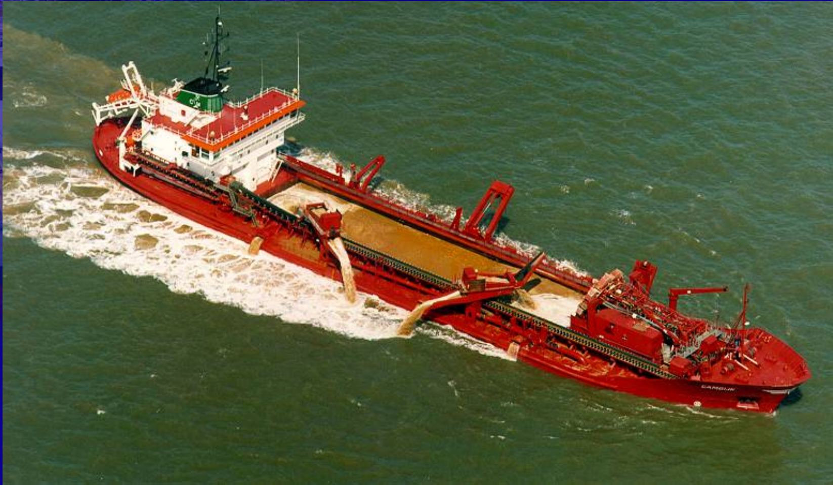
Gravel hopper dredger mining sand & gravel offshore (North Sea)