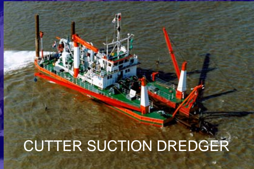
CUTTER SUCTION DREDGER