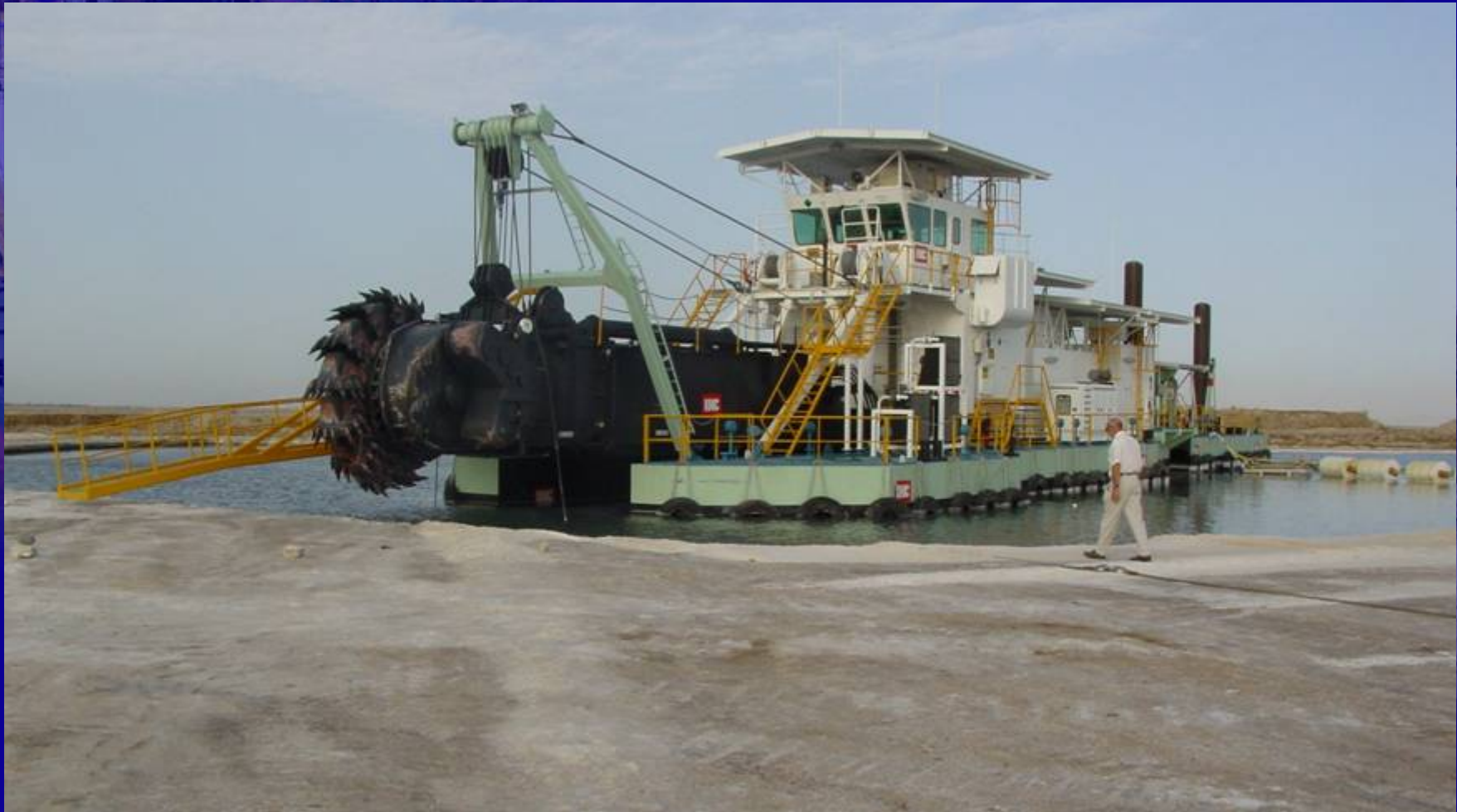
Wheel suction dredger mining in rock salt (Saudia Arabia)