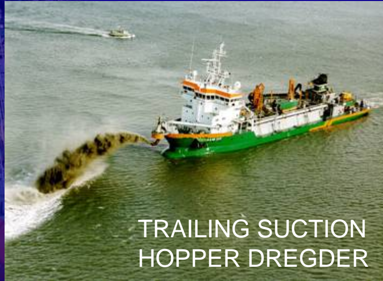
TRAILING SUCTION HOPPER DREDGER