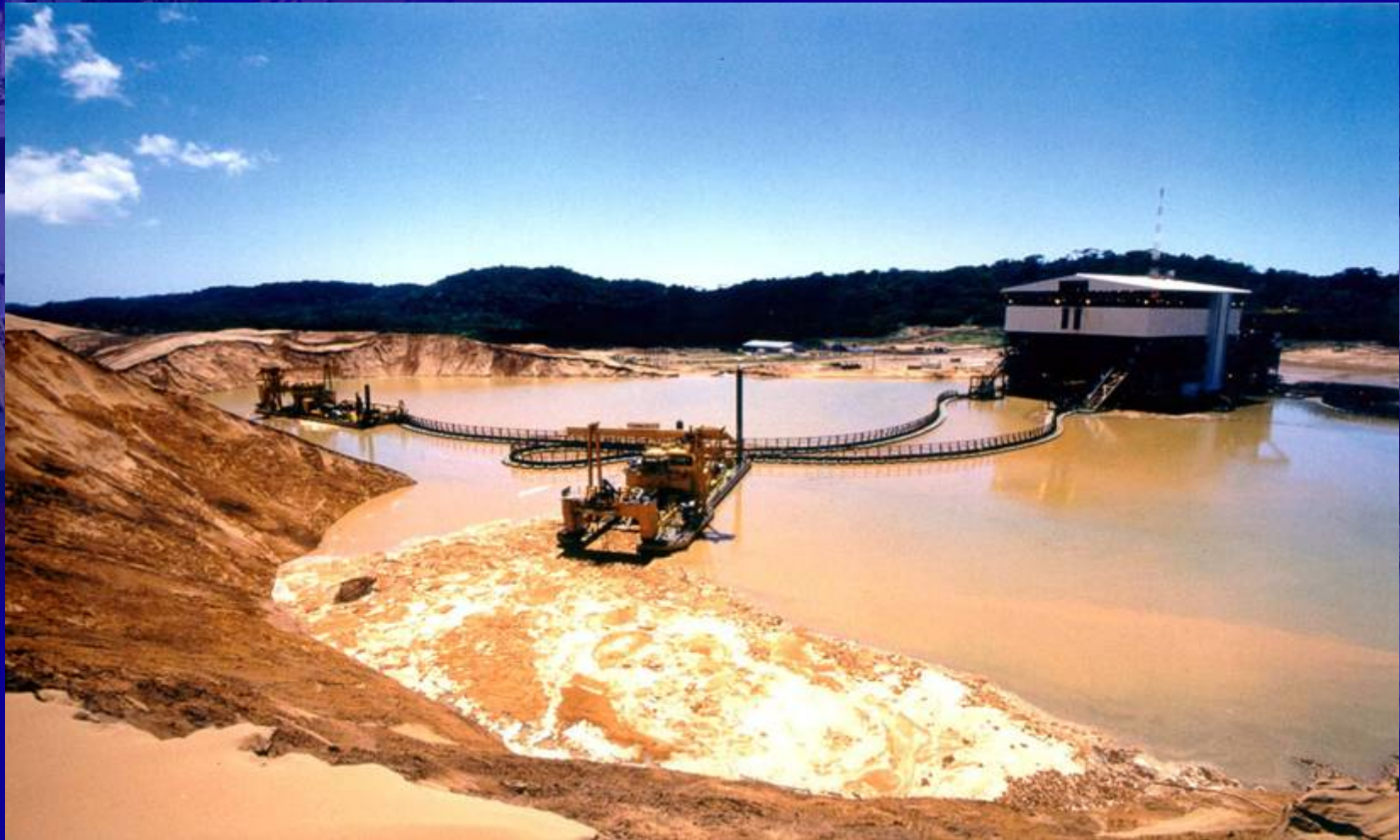
Dredgers at work for the heavy minerals mining industry (South Africa)