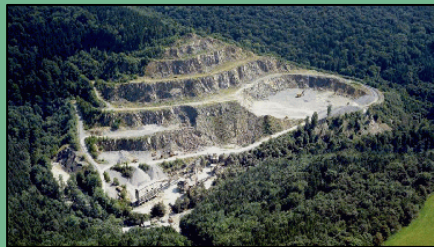
sand, gravel, hardrock (limestone, granite, basalt etc.)