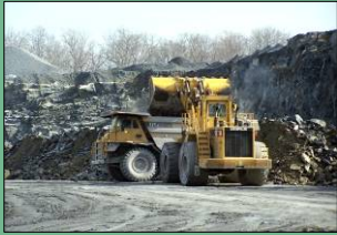
cementitious raw materials (mainly limestone and clay)