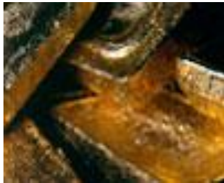
Gold and silver