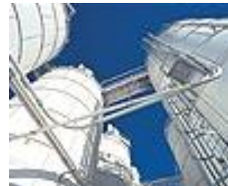
Other products, including nickel