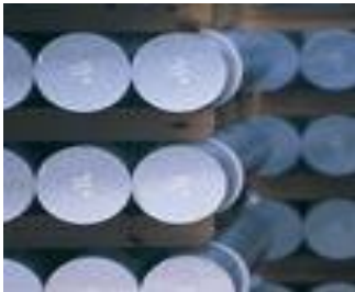
Bauxite, alumina and aluminium